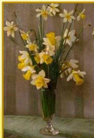
Daffodils c.1935 By William Logsdail